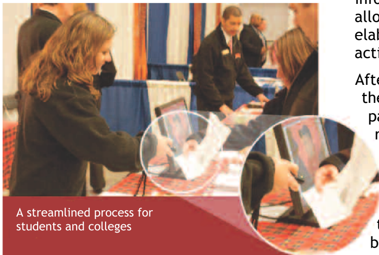
A streamlined process for students and colleges